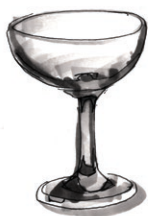
Large Coupe (8.5 oz)