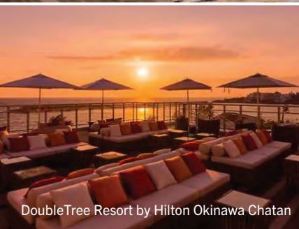
DoubleTree Resort by Hilton Okinawa Chatan