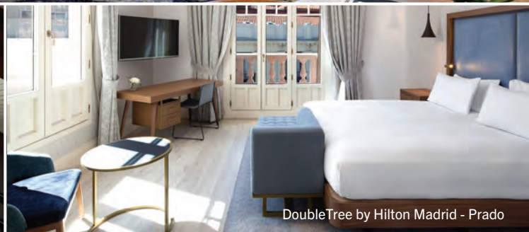
DoubleTree by Hilton Madrid - Prado