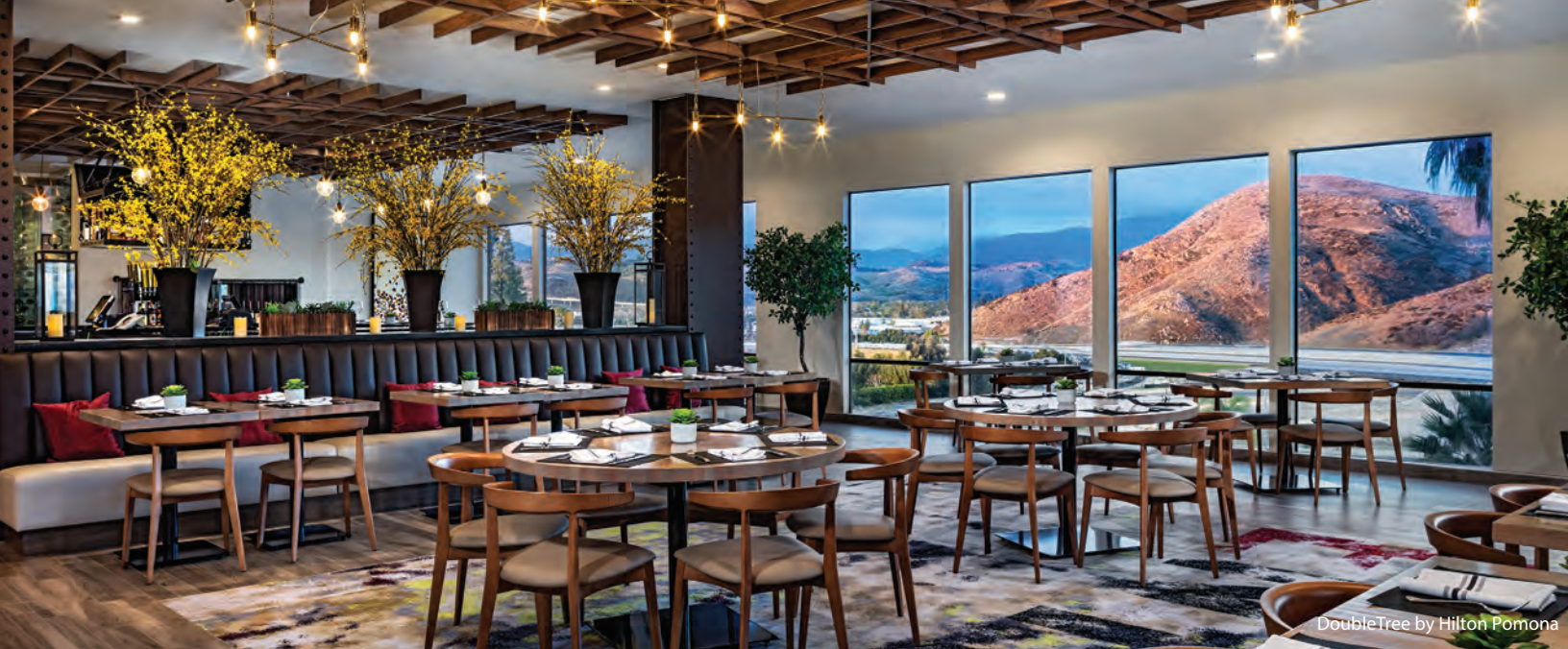
DoubleTree by Hilton Pomona