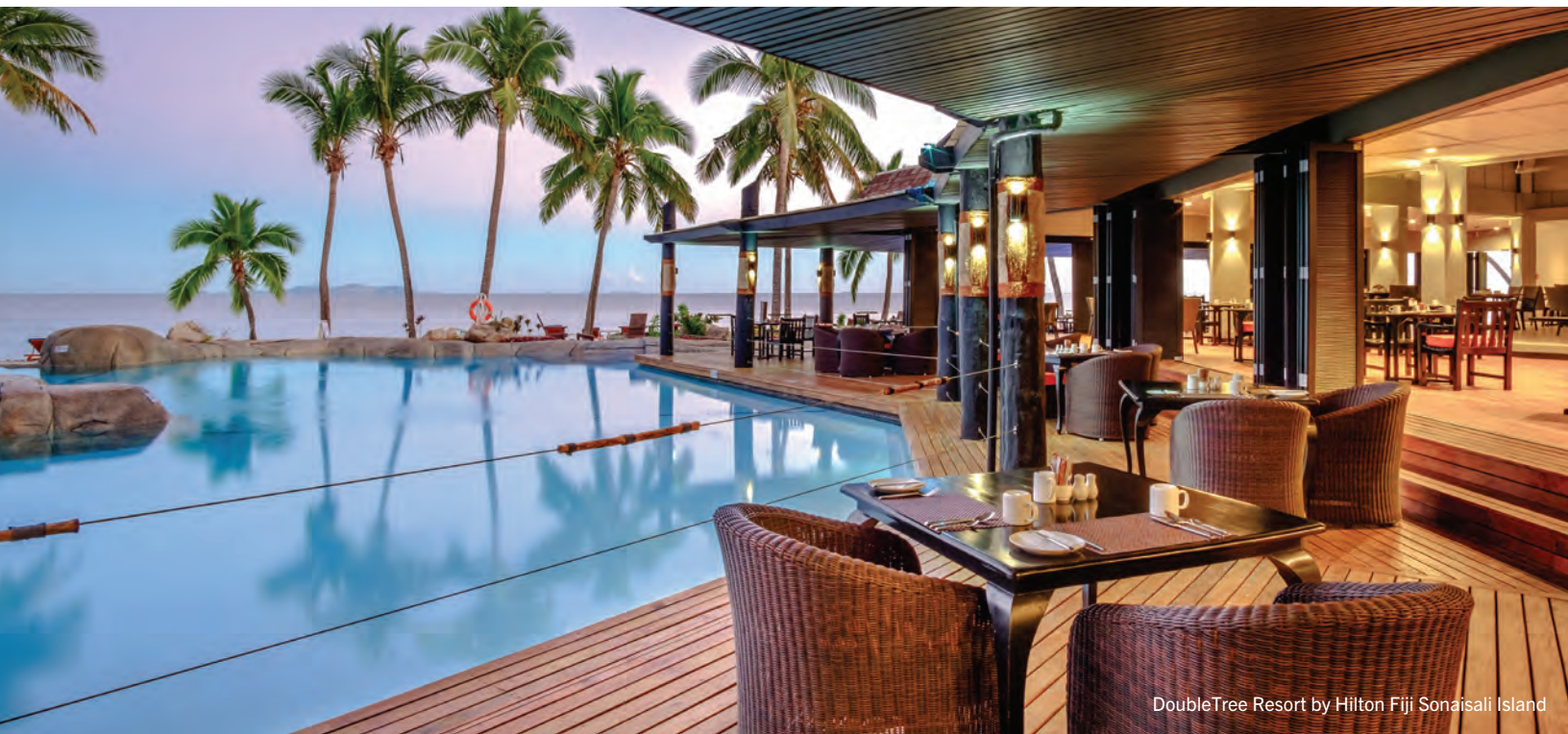
DoubleTree Resort by Hilton Fiji Sonaisali Island